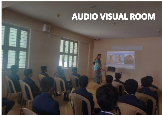
AUDIO VISUAL ROOM