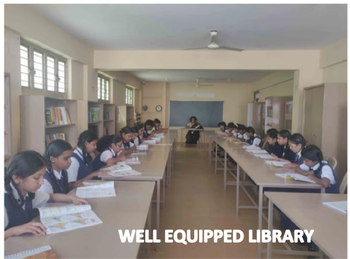
WELL EQUIPPED LIBRARY